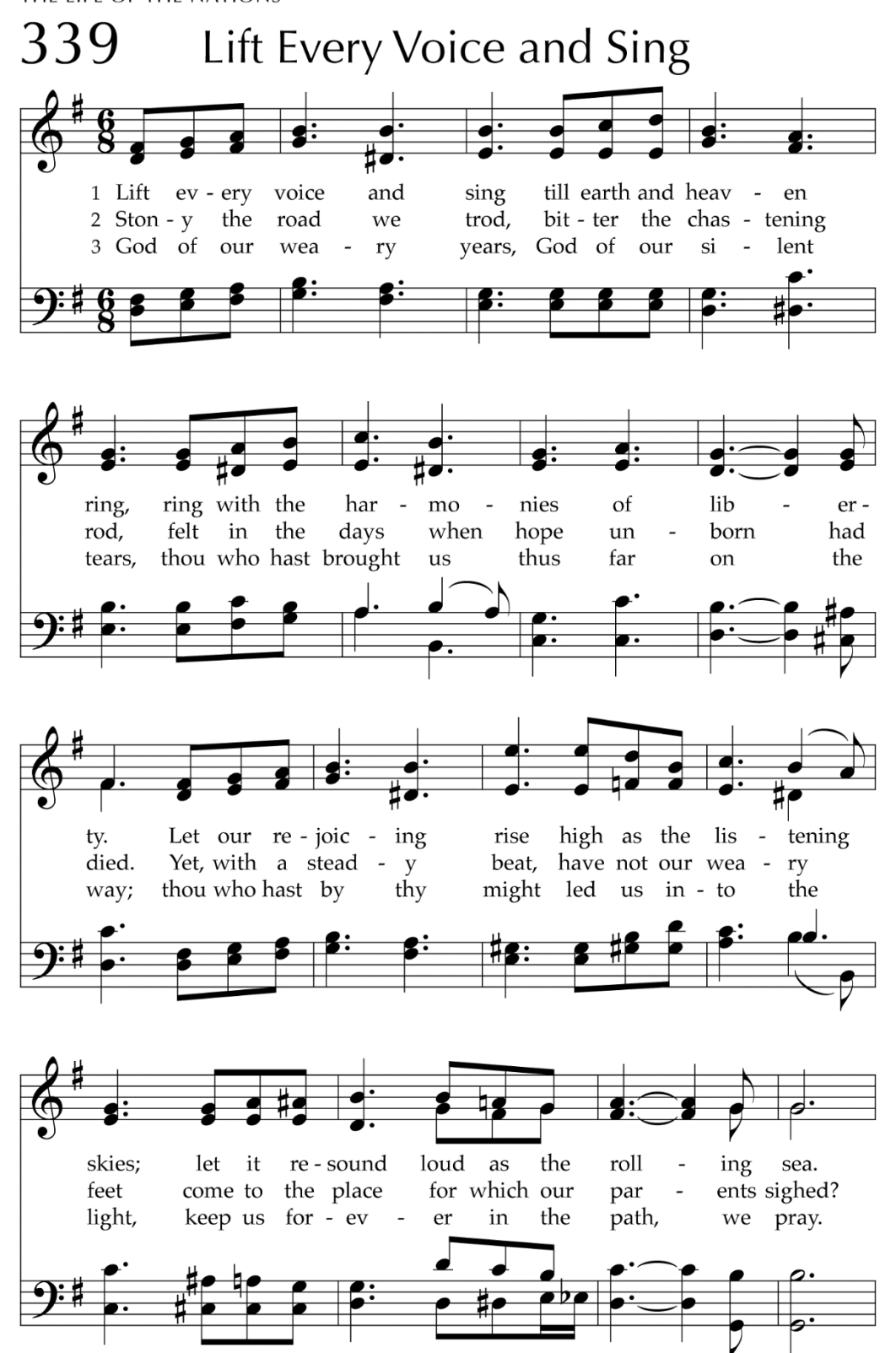
Initially a poem for a school assembly at which Booker T. Washington spoke on Lincoln's birthday in 1900, this text and tune have gained national recognition and devotion, not only within the African American community, but also among all who seek liberation from oppression.